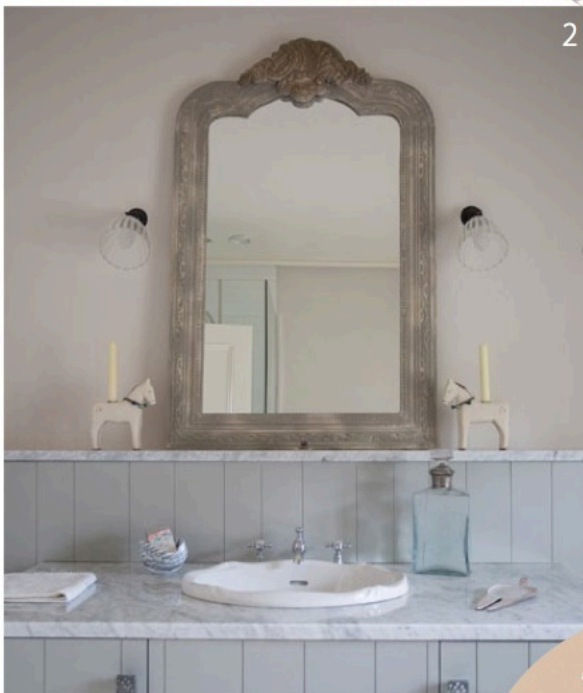
1 Selection of cabinet knobs from Bombay Duck 2 Thompson Clarke Interiors bathroom scheme 3 Knobs from the Haute Deco 'Eclipse' range 4 Bombay Duck Pink Vintage Melon glass door knob 5 'Fleur Du Mal' knobs from Haute Deco bombayduck.com hautedeco.com