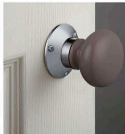
The subtle design of the Mortice Knob, £25, is completed by the contemporary grey porcelain that offers a refined interior finish. ( www.johnlewis.com )