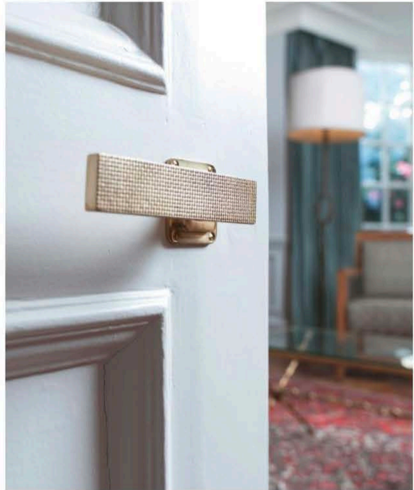
Haute Deco's Bijou textured handle is a simple yet glamorous design made of solid bronze. Available in a variety of modern metallic effects, it costs £370. ( www.hautedeco.com )

Complete your design scheme with these modern interior door handles