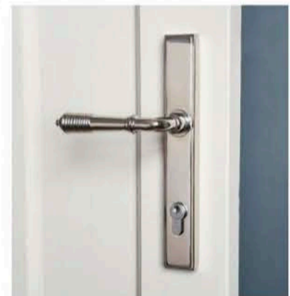
Willow and Stone's Reeded handle, £173.75, takes inspiration from traditional design and is paired with a contemporary slimline backplate. ( www.willowandstone.co.uk )