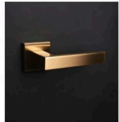
The Hockney lever handles (here in Rich Gold) from Dowsing & Reynolds celebrate pared-back modern design at its finest. £59.99. ( www.dowsingandreynolds.com )