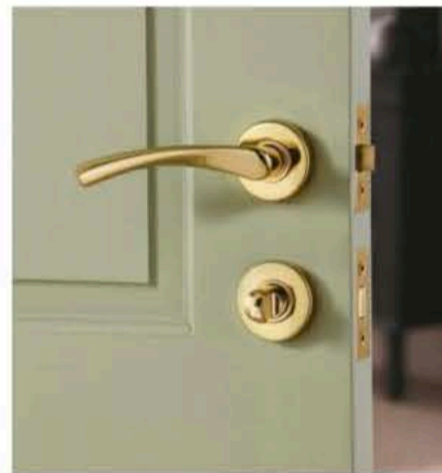
The uncomplicated and understated soft curves of Howdens' Garda Rose handle presents a contemporary take on a traditional form. POA. ( www.howdens.com )