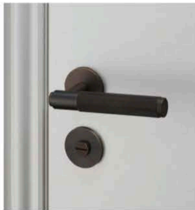
Made from solid anodised metal, this tactile Buster + Punch handle, from £93, is hand-finished and helps complete a modern interior scheme. ( www.busterandpunch.com )