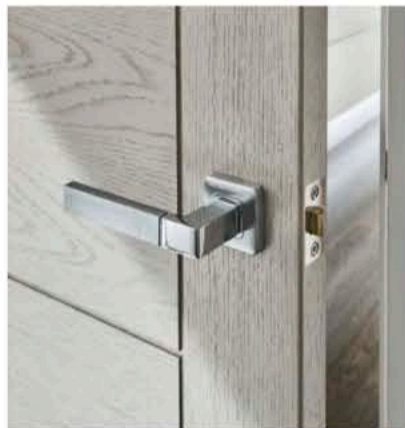
The angular style of the Alento handle in polished chrome can be matched with a full range of interior accessories for a uniform look. POA. ( www.howdens.com )