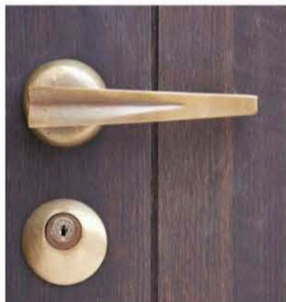
Utilising the timeless beauty of bronze with a simple and elegant leaf motif, this PushPull PP141 handle will develop an individual patina over time, £625. ( www.pushpull.co.uk )