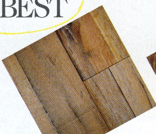
Heritage Timber Edition in Lintel. £89 per sq m ( duchateaufloors.com )