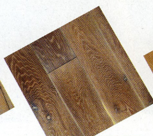
Oak Portobello. From £67.85 per sq m ( ecora.co.uk )