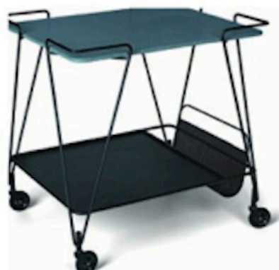
Gubi Matégot trolley , £629, The Lollipop Shoppe: 01273-945300, www.thelollipopshoppe.co.uk