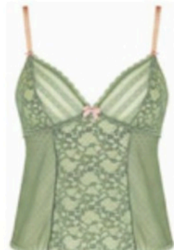
Camisole , £22.50, M&S: 0333-014 8000, www.marksandspencer.com