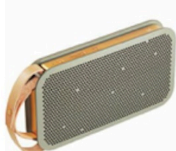
Portable bluetooth speaker , £299.95: Bang & Olufsen at John Lewis: 0345-604 9049, www.johnlewis.com