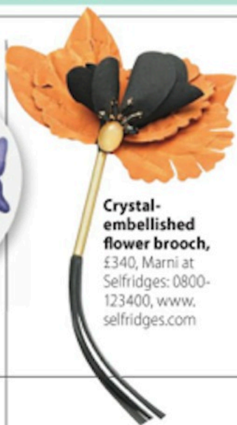
Crystal-embellished flower brooch , £340, Marni at Selfridges: 0800-123400, www.selfridges.com