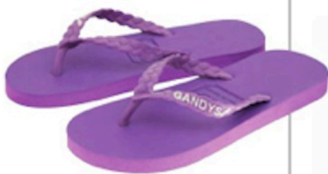
LA flip-flops , £18, Gandys at SeaSoul & Snow: 07968-104756, www.seasoulandsnow.com