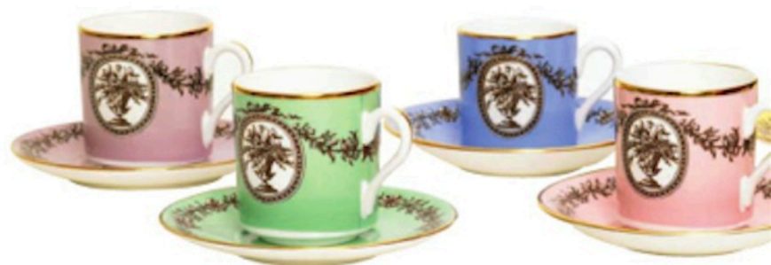
Cartouche coffee cup and saucer set , £140.70 for six, Meltons: 020-7233 9712, www.meltons.co.uk