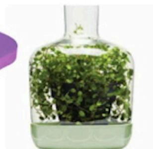
Indoor greenhouse , £29.95, Prezzybox: 0844-249 5007, www.prezzybox.com