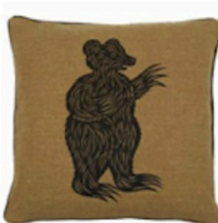
Burlap cushion , £95, Liberty: 020-7734 1234, www.liberty.co.uk