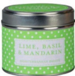
Lime, basil and mandarin candle , £8.50, The Country Candle Company: 01225-794920, www.thecountrycandlecompany.com