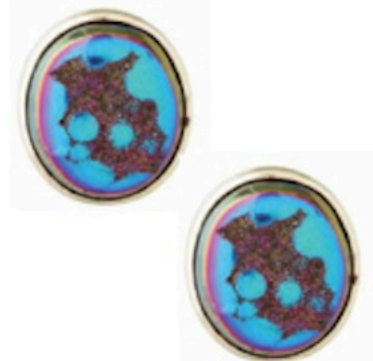
Silver rainbow oval earrings , £1,175, Stephen Dweck at Liberty: as before