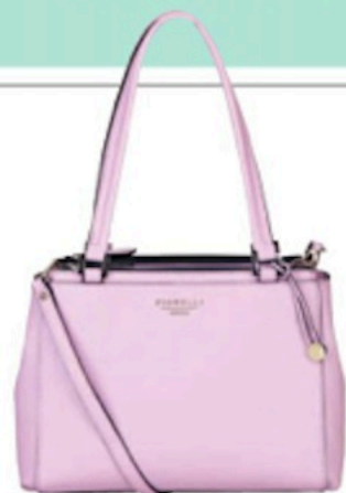
Sophia medium shoulder bag , £59, Fiorelli: 01252-533561, www.fiorelli.com