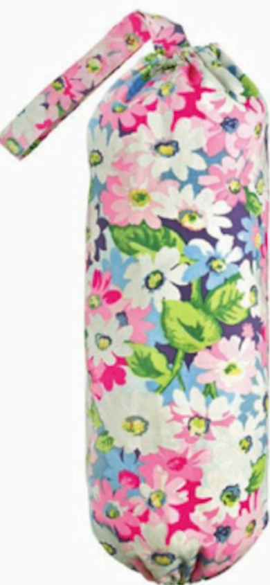
Carrier bag store , £10, Cath Kidston: 0845-026 2440, www.cathkidston.com