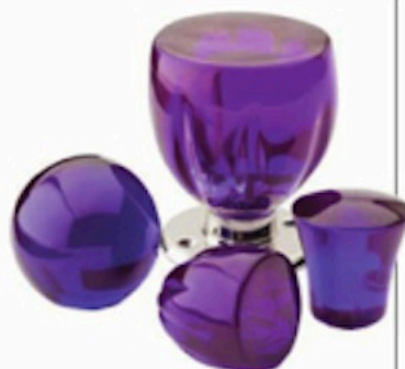
Amethyst glass doorknobs , from £53, Haute Déco: 020-7736 7171, hautedeco.com