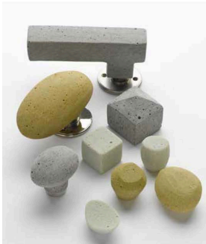
LEFT TO RIGHT Upsurge a natural, earthy-themed home with these selected Bauhaus pumice and sand-stone knobs and levers.